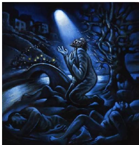
The Garden of Gethsemane