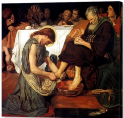
Jesus Washes the Feet of the Disciples